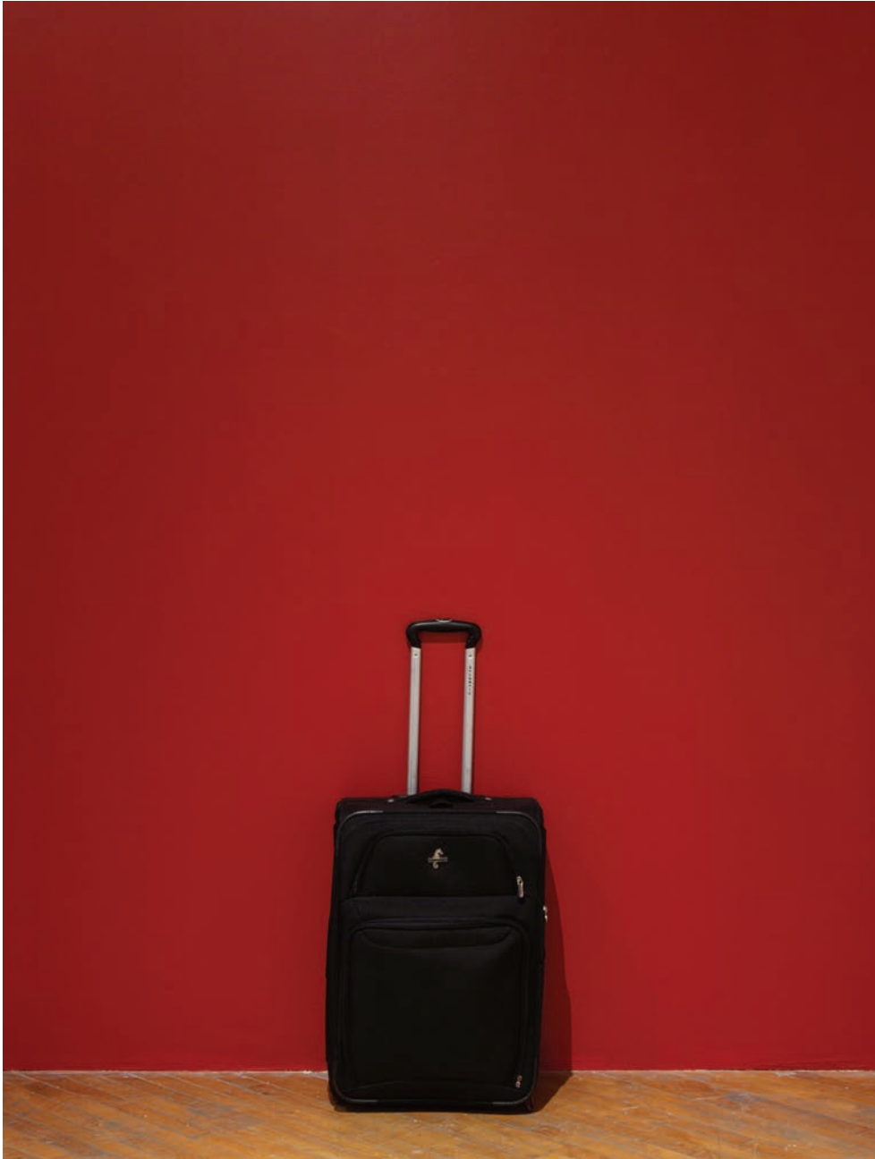
Come Home (detail), 2015, performance, four hours

Critical Distance is a writing program of aceartinc. that encourages critical writing and dialogue about contemporary art. The program is an avenue for exploration by emerging and established artists and writers. Written for each exhibition mounted at aceartinc. these texts form the basis of our annual journal Paper Wait.