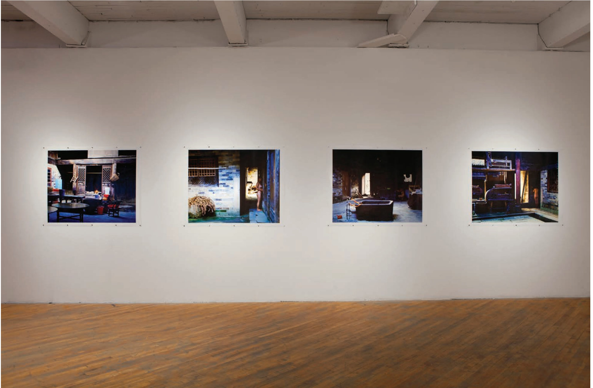
State of Grace , 2013, 40"x50", inkjet prints